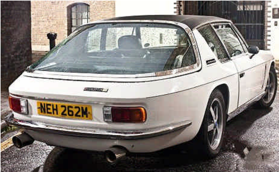
The rear view