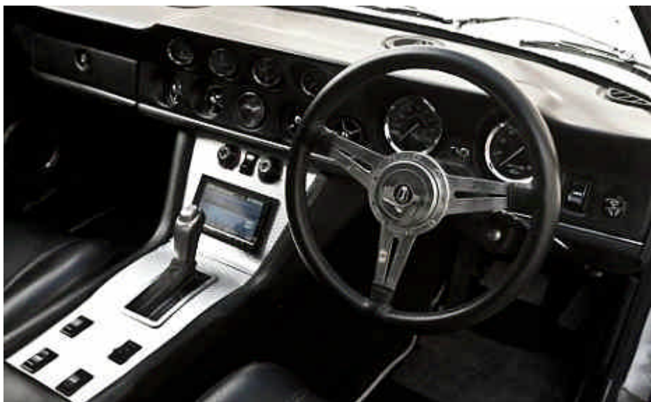
The steering wheel

Italian-designed but built in West Bromwich with a massive 7.2-litre American V8 up front, it was more expensive than an Aston Martin, more powerful than an E-type and rarer than a Bentley. It was so legendary that Jenson Button's dad named him after it (getting the spelling wrong). And then it disappeared.