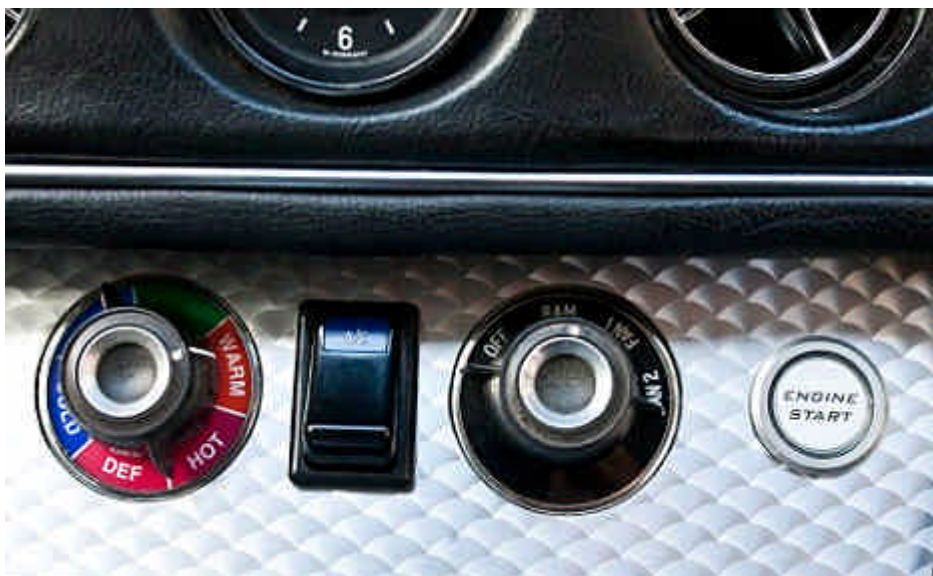
The retro control panel

Dozens of car firms went to the wall while I was at junior school and with its small, costly output Jensen was never going to survive, so by the time I was putting car posters on my wall it was a distant memory. In a way, it's just as well it faded into history. The reality of cars from those days is that they always, always broke down. So I'm very glad that the one I'm driving here is not what it seems.